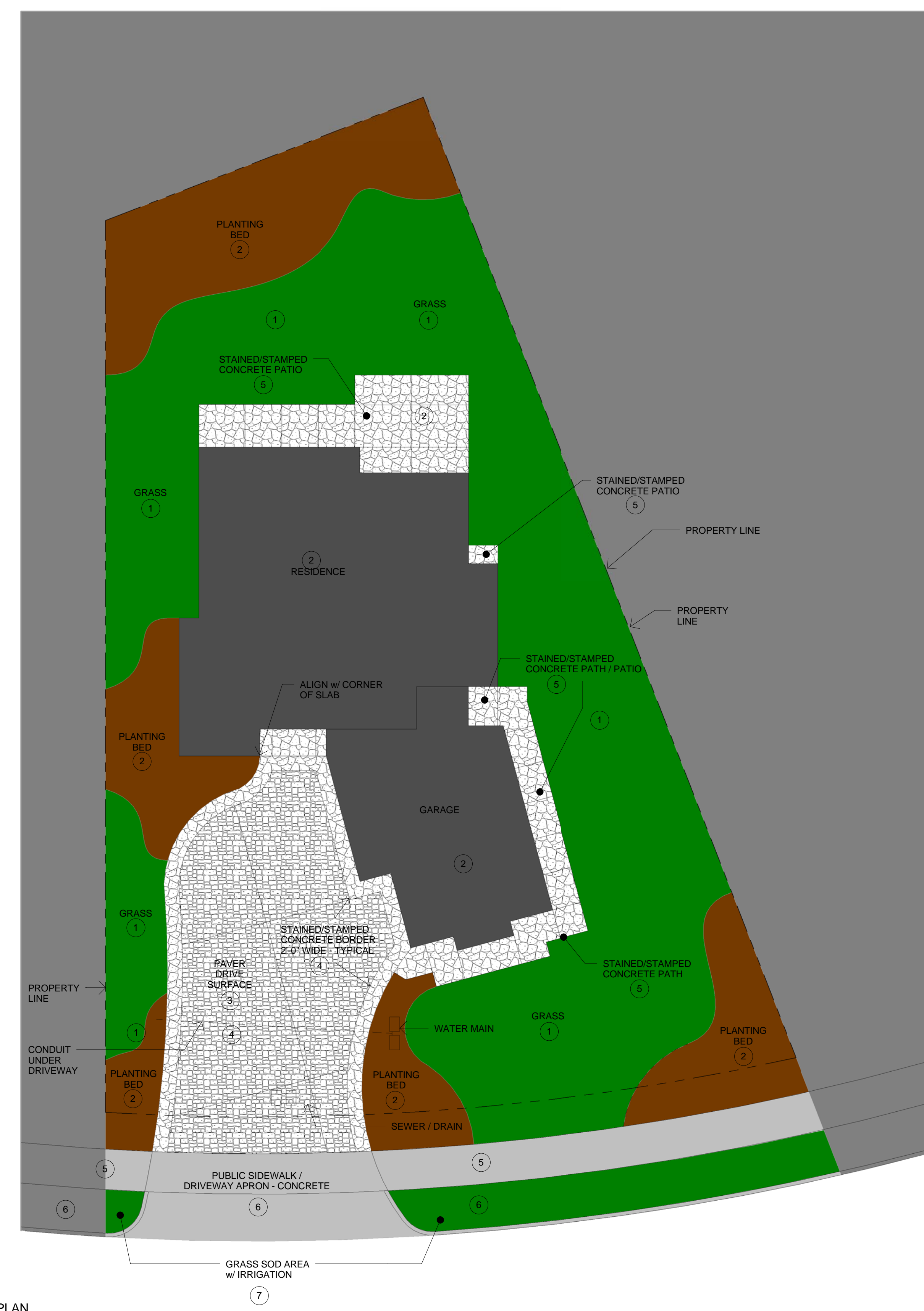
① SITE PLAN 1" = 10'-0"