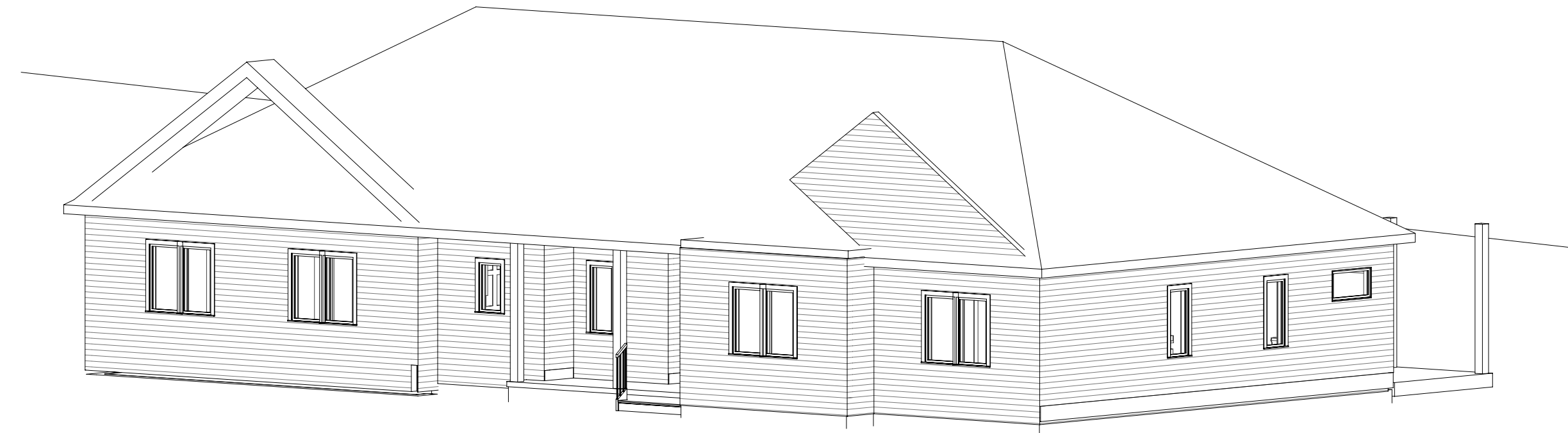
2 FRONT VIEW